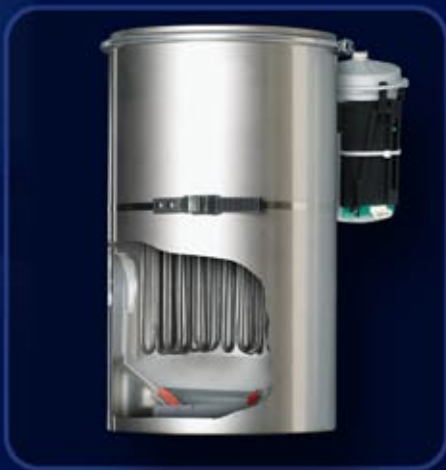
Steam cylinder with level monitoring

The steam cylinder is a stainless steel design, easy to clean and practically indestructible. Mk5 users can take operational reliability for granted, thanks to the combination of the resistance principle, electronic water level monitoring and the cylinder. Normal drinking- and DI water can be processed.